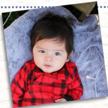
"Baby A's" life was saved through Abortion Pill Reversal at the Pregnancy Clinic. He was born in summer of 2022.

Arundel Baptist Church | Arundel Christian Church | Bay Area Community Church | Belcroft Bible Church | Broadneck Evangelical Presbyterian Church | Chesapeake Christian Center | Chesapeake Christian Fellowship | Cornerstone Church | DaySpring Presbyterian Church | Edgewater Bible Church | Evangelical Presbyterian Church of Annapolis | Faith Community Church | First Evangelical Lutheran Church | Galilee Lutheran Church | Grace Baptist Church | Grace Evangelical Presbyterian Church | Grace Pointe Community Church of the Nazarene | Grace Presbyterian Church | Harvest Bible Chapel | Holy Family Catholic Church | Hope Christian Church | Kettering Baptist Church | Lake Shore Baptist Church | Lighthouse Church | Living Hope Church | Mid Atlantic Community Church | Mosaic Christian Church | Mt. Oak United Methodist Church | Our Lady of the Fields Church | Riverdale Baptist Church | Severn Covenant Church | Severn Run Evangelical Presbyterian | Severta Park Baptist | South River Bible Church | St. Andrew's Anglican Church | St. Edward the Confessor Church | St. Elizabeth Ann Seton Church | Trinity Bible Church | Victory Breakthrough Ministries, Inc. | Weems Creek Baptist