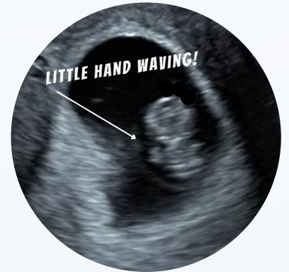
Ultrasound image of a 8-week preborn baby as seen on one of our ultrasound machines